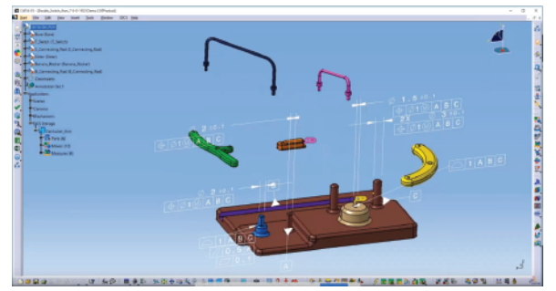
Read in embedded GD&T in the form of PMI and FTA

With push-button reporting, instantly create html and Excel reports from your analysis results to share with colleagues.