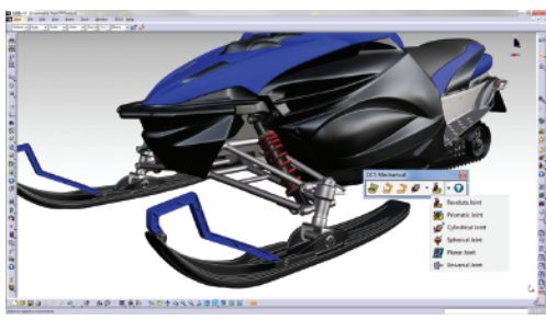
Validate your product through its range of motion